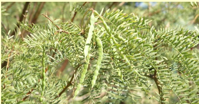
Honey Mesquite Beans